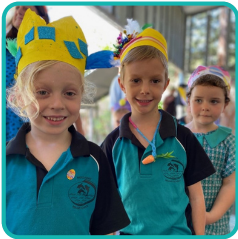
Lorikeet students lining up for the parade.

On Thursday, 28 March, all Kindergarten, Year 1 and Year 2 students were invited to make an Easter hat and join in the Easter Hat Parade. Parents and family members joined us to help make and decorate the hats. We had a fabulous turnout, and the parade and stage performances were great fun.