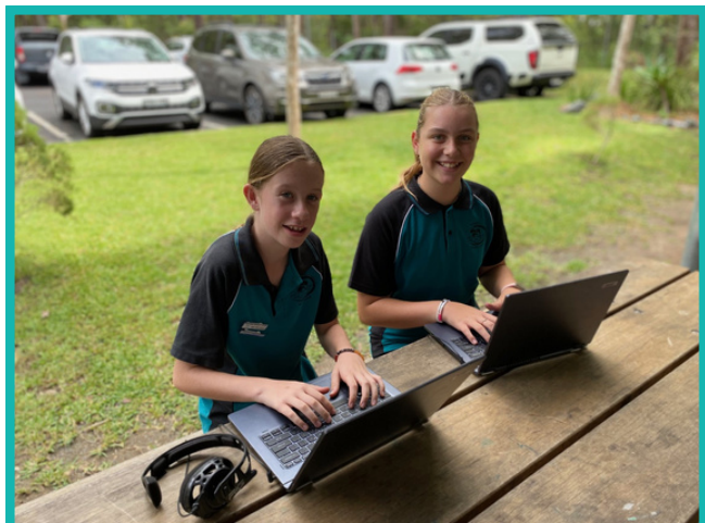
Preparing and practising for the Multicultural Perspectives Public Speaking Competition