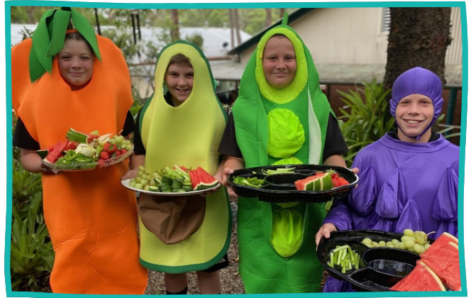
Our leading fruit and vegetables