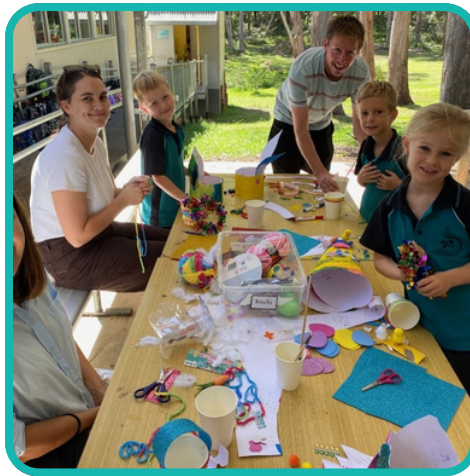
Making our hats for the parade.